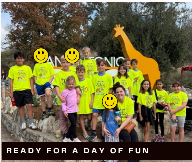
READY FOR A DAY OF FUN