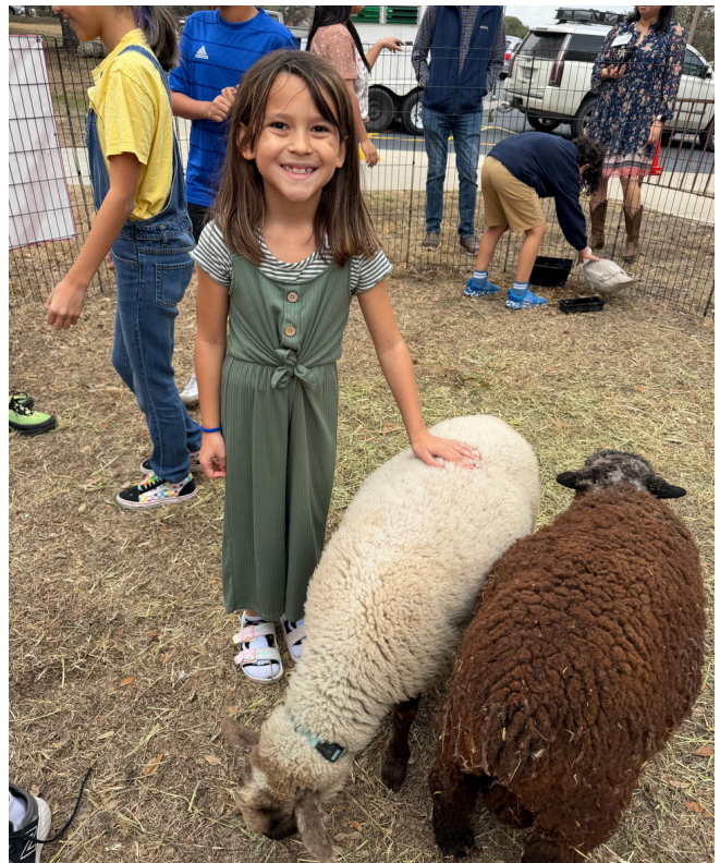
PETTING ZOO FUN

Rodeo Day was exciting. The weather was nice. Most of our class dressed normal but some classes had students wearing country western outfits. We always have fun doing special event days. Most of us wish we could skip lessons on those days but we have to do our work still.